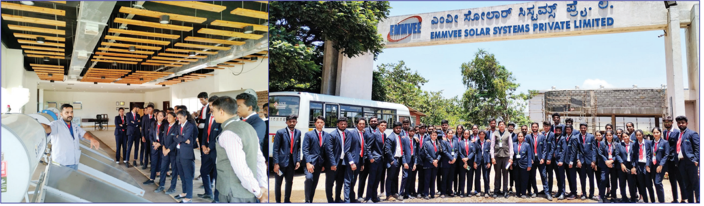
Industry Expert at Emvee Solar sharing insights about the systems

Emmvee Photovoltaic Power Private Limited, one of the leading players in the Indian Solar Energy industry for the last two decades. Emmvee offers turnkey solutions for MW scale photovoltaic projects with strong market existence in India and