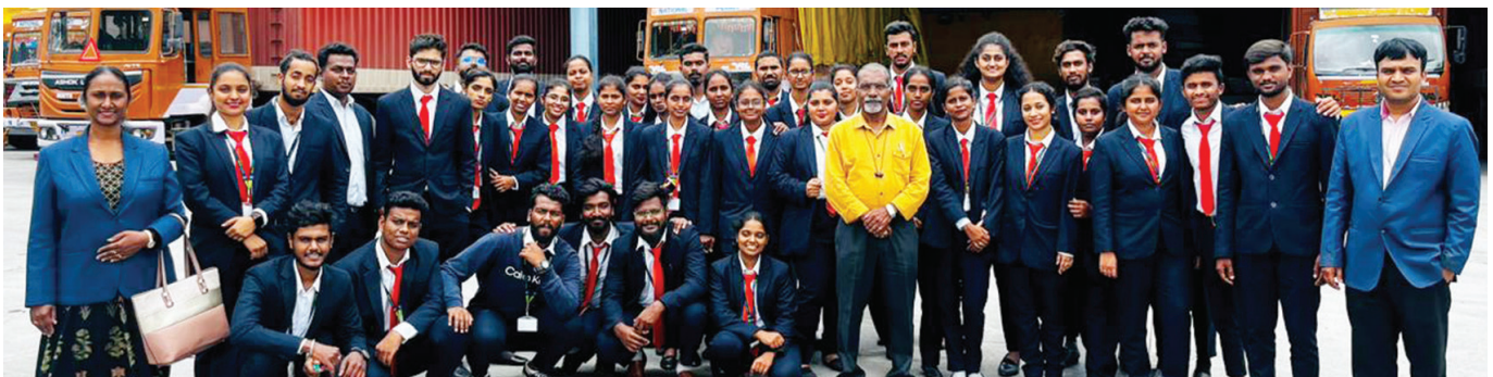
Students exploring the ware housing facility at VRL

VRL Logistics Ltd, Dabaspet - Nelamangala. VRL Logistics, a company committed to giving quality & reliable service for on-time delivery. Within a short span of time the company has emerged as the largest fleet owner of commercial vehicles in India's private sector. The visit was highly informative as it familiarized students