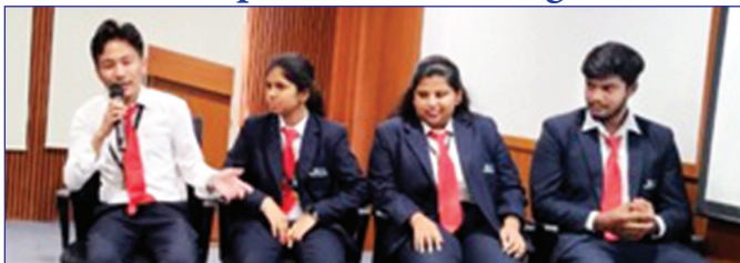
Students engaged in constructive discussion.