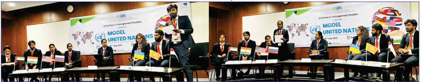
Students playing the role as president and delegates representing various countries and discussing various implications of the Ukraine war on World Trade.

Model United Nations, also known as Model UN or MUN, is an educational simulation in which students learn about diplomacy, international relations and the United Nations.