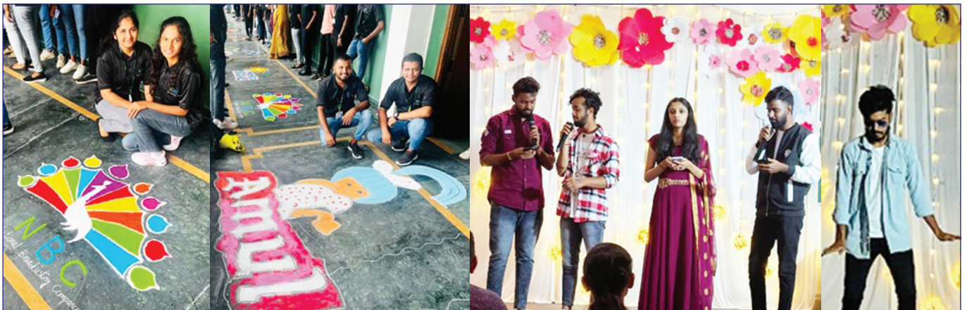
Brand Rang event